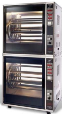
SCR 16 stacked 16-spit rotisserie

The sight, smell and taste of rotisserie chicken can add significant impact and sales to your store. With such a powerful appeal to the senses, choosing your equipment is critical.