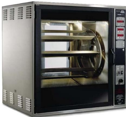
SCR 8 countertop 8-spit rotisserie