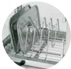
Upright support for containers

Below is a selection of accessories for different types of dishes. See the product sheet for more accessories.