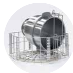
Pot holder for large pots