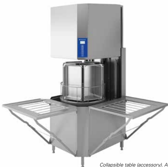
Collapsible table (accessory). Available for right, left and front installation.

By choosing smart accessories you can adapt your WD-90 DUO to the needs of your kitchen. Collapsible tables simplify stacking and can be fitted at the front or to the sides. The potwashing basket can be equipped with different accessories to keep items in place. See the product sheet for more WD-90 DUO accessories.