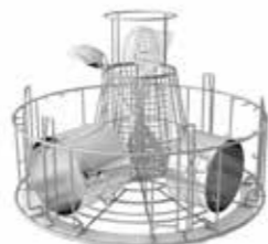
Saucepan support and ladle holder