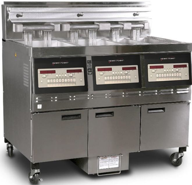
GVE 073 3-well manual low oil volume open fryer with two full vats and one split vat

Henny Penny low oil volume open fryers use innovative design and control technology to significantly reduce frying oil consumption, extend oil life, improve fried product quality and reduce overall oil consumption and costs. Here's how: